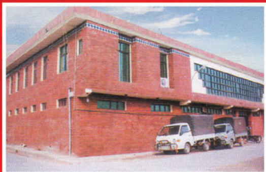
FACTORY UNIT (1)