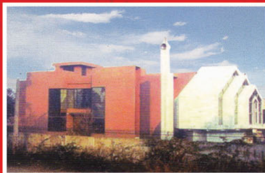
FACTORY UNIT (2)